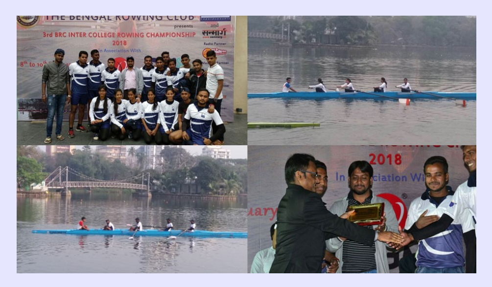
Best Disciplined College Award 3rd BRC Rowing Championship

Runner Up Football- C.U. Inter College Games & Sports Championship 2019-20