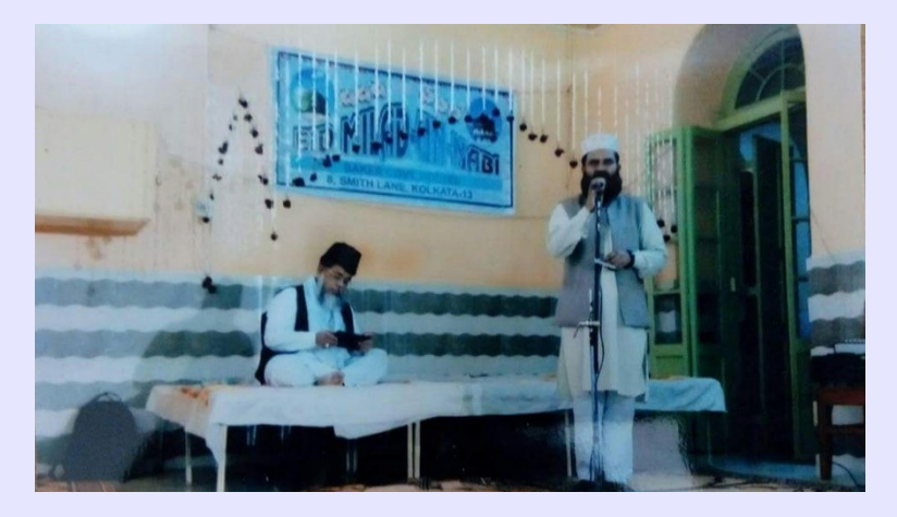
Milad Un Nabi

More info: <u>https://maulanaazadcollegekolkata.ac.in/culturalactivitiesgallery.php</u>