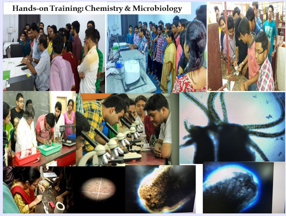
DBT Star College Sponsored Hands-on-Training Session